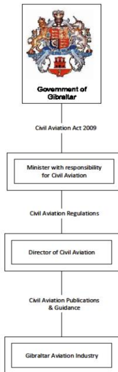
Figure 2 – Gibraltar civil aviation framework

7.4.4. The Gibraltar civil aviation framework is shown at Figure 2.